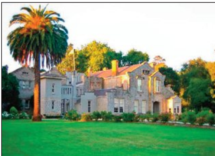
Ercildoune Homestead near Learmonth.

They also mention the good hand of God upon them — guiding and directing them and causing all things to work together for their good plus how important it is for a young man to know that a father and mother's eye is upon him — warning and encouraging him. It is incredible that he says he was wholly unable to cope with the superior talent and energy of his co-evals in the Old Country. But he was able to prosper in