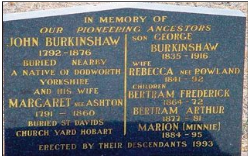
Memorial plaque to the Burkinshaw family at the Wareek cemetery.