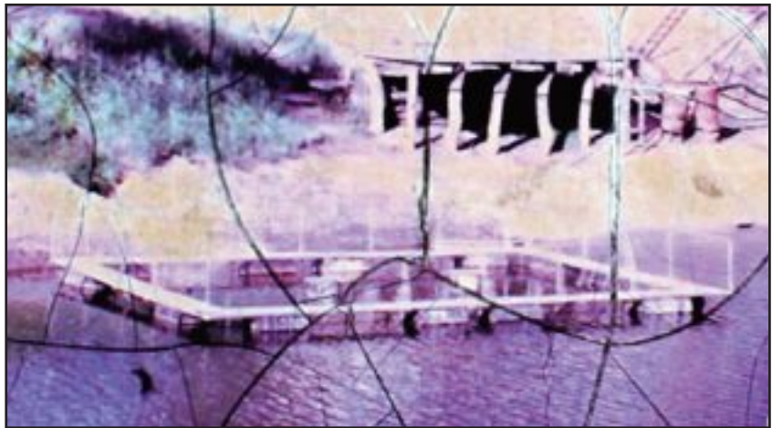
An old photo of the Dimboola swimming crate on the Wimmera River.

Dimboola summer days were hot and long — the end of the school day brought the greater